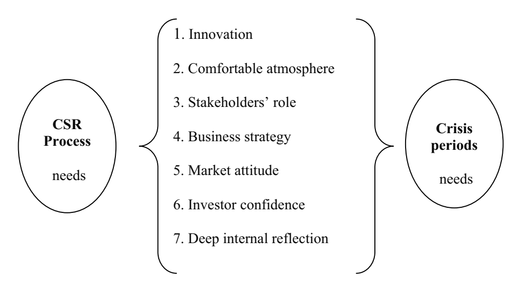
Figure 1. CSR implementation process and crisis periods: necessities.

Although these models are diverse, there are a set of common issues in nearly all of them which can be redirected to change the perspective of implementing CSR models from a threat to an opportunity in periods of crisis (Figure 1):